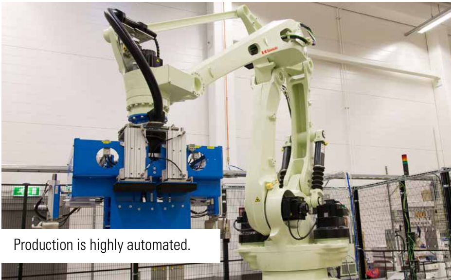
Production is highly automated.

All PRF aerosol products have been granted the official Finnish certificate "Key Flag" for being made in Finland. In addition to our own staff, we employ many domestic operators from the label vendor to truck drivers. According to studies, the domesticity of products and services is important to Finns and we are proud to be involved in maintaining industry in Finland.