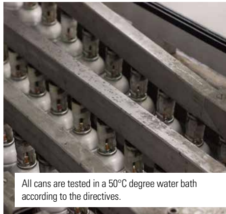
All cans are tested in a 50°C degree water bath according to the directives.